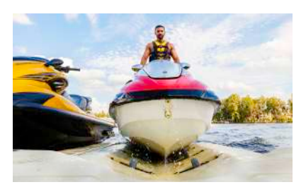
The EZ Port 2i's revolutionary design makes driving on smooth and effortless — just Idle up, ease into the throttle, then roll to the front of the port.