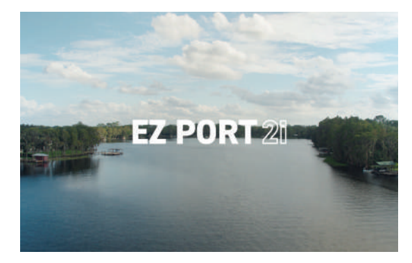
Visit the EZ Dock YouTube channel to see why the EZ Port 2i was the first and is still the best.